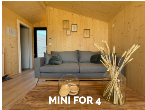
MINI FOR 4

Be one with nature in this gorgeous mirrored house.